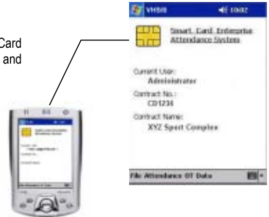
▲ Mobile Computing Device Attendance Module