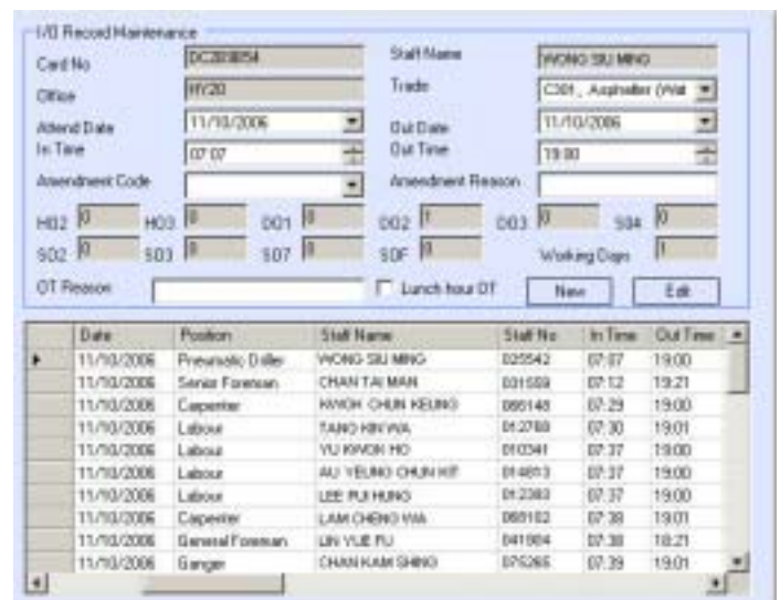
▲ Attendance Data Consolidation